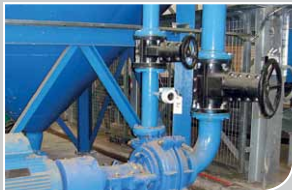
Flowrox PVEG valves at Sims Metal Recycling

Early 2011, Flowrox PVEG valves were chosen by Sims Metal Recycling at one of their recycling plants in the UK. The light-weight manual operated PVEG valves are used to isolate pumps and tanks in their DMS plant. Flowrox products form a key part of Sims' continued investments in the latest products and separation technologies, allowing them to recover maximum metal at minimum cost.