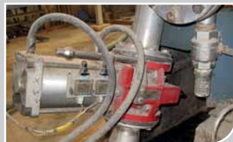
Flowrox pinch valves at GIIC

Flowrox pinch valves were chosen in 2008 when Gulf Industrial Investment Company (GIIC) was commissioning their second iron ore pelletising plant in the Kingdom of Bahrain. Flowrox pneumatically actuated PVE 100 – 150 mm valves are operating in pellet coating and iron ore slurry lines as well as in various side applications. The GIIC plant provides the highest quality pellets to markets all over the world. The best flow control solution was built in cooperation