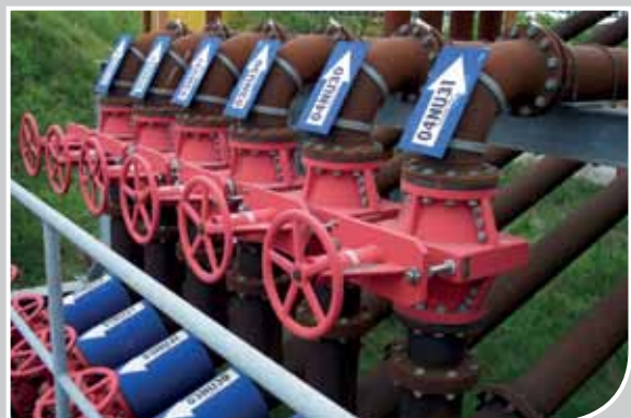
Flowrox pinch valves at DONG Energy

DONG Energy, one of the largest coal power plants in Denmark, has gained valuable benefits with Flowrox valves in their boiler ash/slag slurry installation. In the application, boiler ash/slag is grinded, mixed with sea water and then pumped into settling ponds. In 1996, a total of 31 Flowrox pinch valves were installed in the application. This abrasive and aggressive slurry sets high requirements for on/off slurry valves, and Flowrox pinch valves have more than fulfilled them. Benefits for the customer include excellent wear resistance, reliable operation and extended sleeve lifetime.